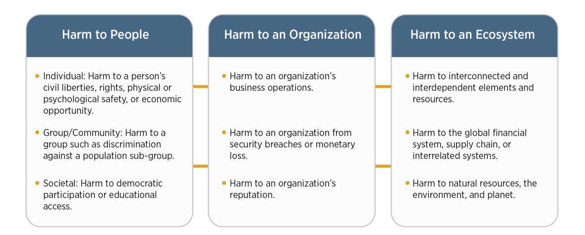
Fig. 1. Examples of potential harms related to AI systems. Trustworthy AI systems and their responsible use can mitigate negative risks and contribute to benefits for people, organizations, and ecosystems.