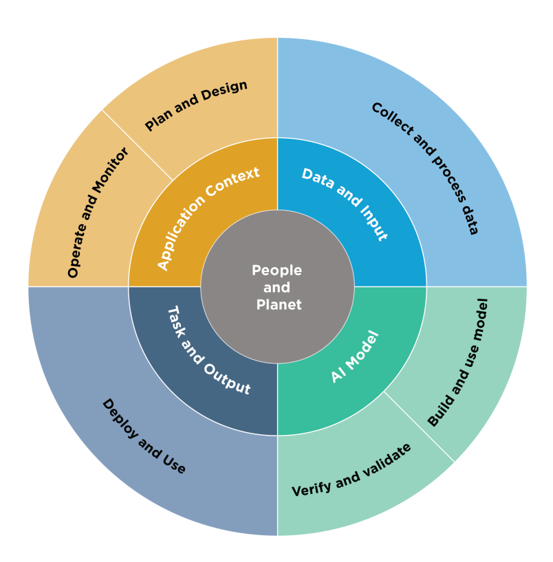
Fig. 2. Lifecycle and Key Dimensions of an AI System. Modified from OECD (2022) OECD Framework for the Classification of AI systems — OECD Digital Economy Papers. The two inner circles show AI systems' key dimensions and the outer circle shows AI lifecycle stages. Ideally, risk management efforts start with the Plan and Design function in the application context and are performed throughout the AI system lifecycle. See Figure 3 for representative AI actors.

environmental groups, civil society organizations, end users, and potentially impacted individuals and communities. These actors can: