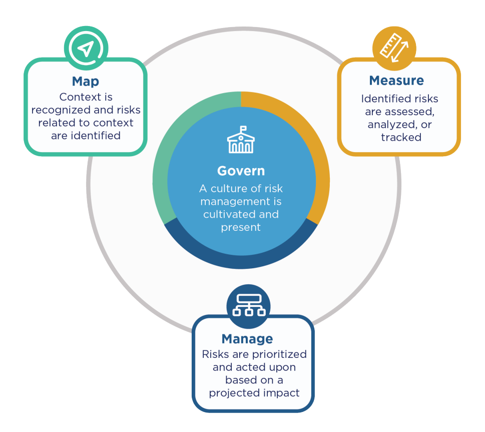
Fig. 5. Functions organize AI risk management activities at their highest level to govern, map, measure, and manage AI risks. Governance is designed to be a cross-cutting function to inform and be infused throughout the other three functions.

The AI RMF Core provides outcomes and actions that enable dialogue, understanding, and activities to manage AI risks and responsibly develop trustworthy AI systems. As illustrated in Figure 5, the Core is composed of four functions: GOVERN, MAP, MEASURE, and MANAGE. Each of these high-level functions is broken down into categories and subcategories. Categories and subcategories are subdivided into specific actions and outcomes. Actions do not constitute a checklist, nor are they necessarily an ordered set of steps.